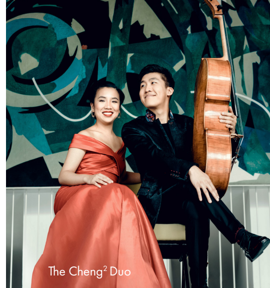
The Cheng² Duo